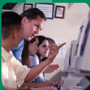
Proficiency in 21st Century Skills