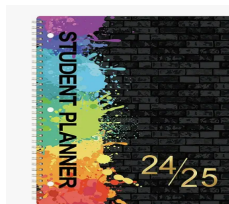
Student Planner 2024-2025 - Monthly and Weekly School...