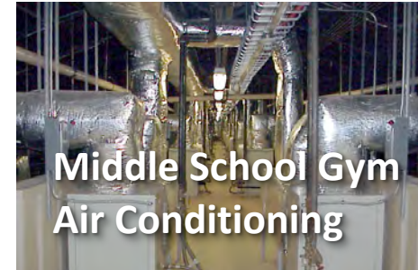
Middle School Gym Air Conditioning