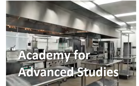
Academy for Advanced Studies