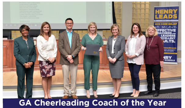
GA Cheerleading Coach of the Year