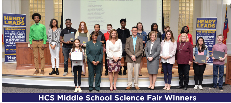
HCS Middle School Science Fair Winners