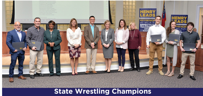
State Wrestling Champions