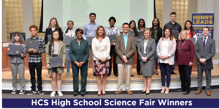
HCS High School Science Fair Winners