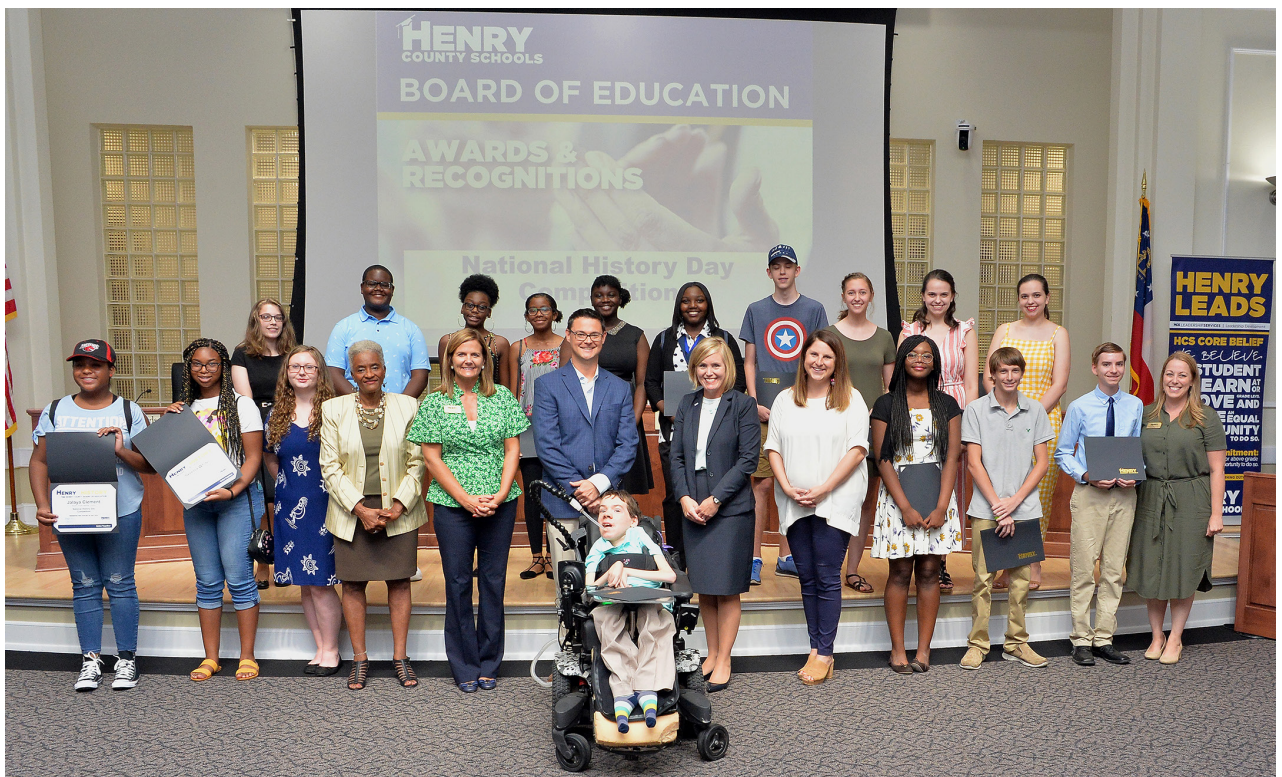
National History Day Winners