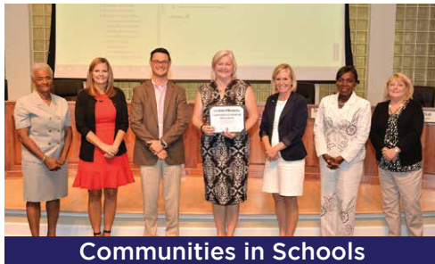
Communities in Schools