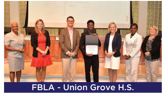
FBLA - Union Grove H.S.