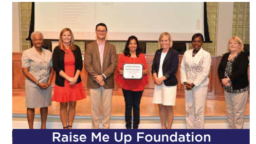
Raise Me Up Foundation