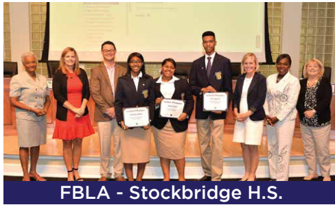
FBLA - Stockbridge H.S.