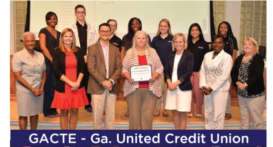
GACTE - Ga. United Credit Union