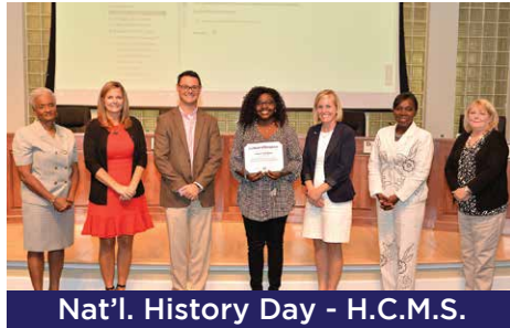
Nat'l. History Day - H.C.M.S.