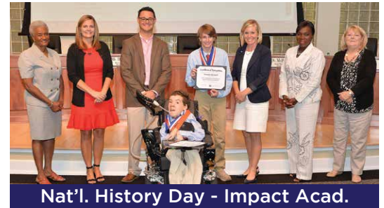
Nat'l. History Day - Impact Acad.