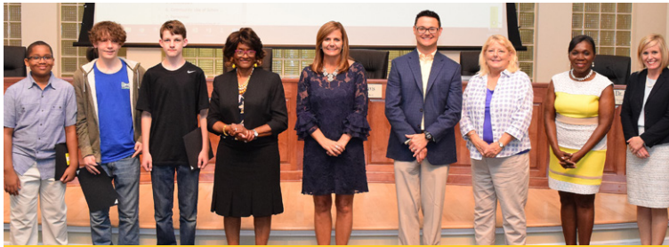
CTAE - VEX IQ