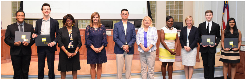
CTAE - SkillsUSA