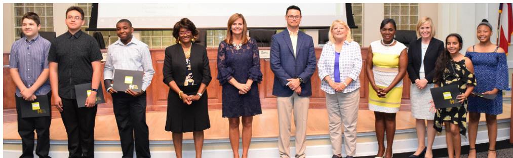
CTAE - TSA