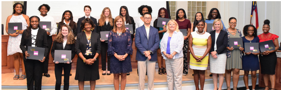
CTAE - HOSA