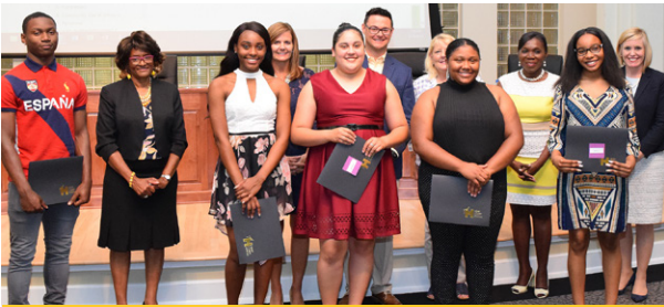
CTAE - DECA