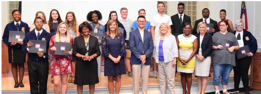
CTAE - FFA