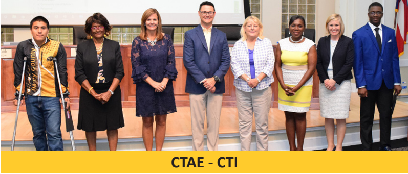
CTAE - CTI