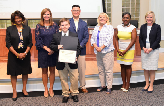
Young Georgia Authors Writing Competition – State Winner