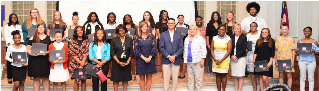
CTAE - FCCLA