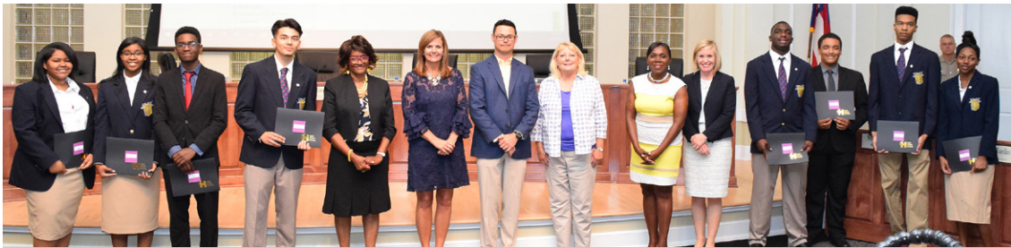
CTAE - FBLA