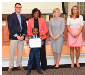
Treandos Thornton Dutchtown Elementary Community Food & Toy Drive